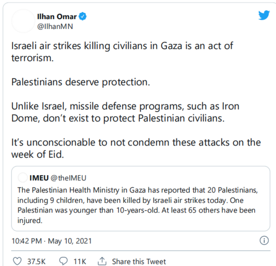
Figure 2. Ilhan Omar's tweet became a news source

Ilhan Omar accuses Israel of 'terrorism' amid clash with Hamas (10/5/2021) he called the Israeli attack as an act of terrorism: Israeli air strikes killing civilians in Gaza is an act of terrorism. Palestinians deserve protection... It's unconscionable to not condemn these attacks on the week of Eid.